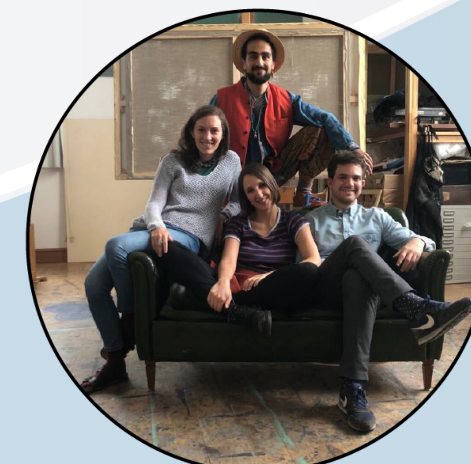
Young Artists Artists from Germany